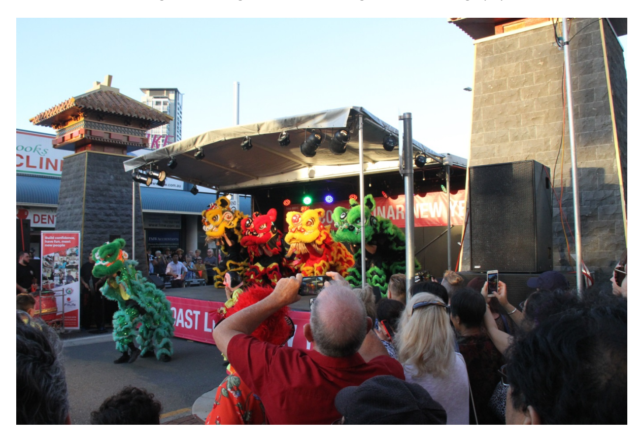
Chinese culture enthusiasts enjoying the Lion Dancing