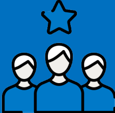
Team talk cards