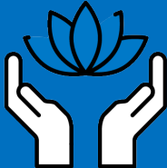
Surviving to thriving recorded webinar