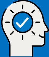
Building healthy coping skills module