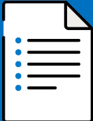
Mental health fact sheets