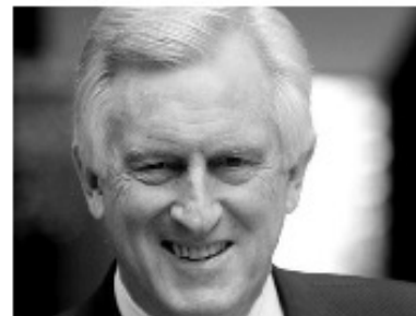
PROF JOHN HEWSON AM