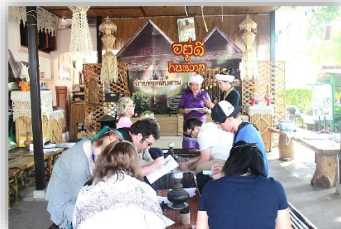
Photo Caption: The Tai Lue are an ethnic group from Thailand, Laos, China, Myanmar and Vietnam. There are approximately 280,000 Tai Lu people in the world. The group currently speak Southern Western Tai Language. Baan Tai Lue offers a unique insight into local wisdom through cooking activities, singing northern Thai songs, and weaving baskets. This session offers students the chance to learn more about ethnic groups in Thailand.