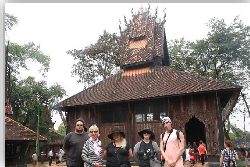
Photo Caption: The Black House (Baandam) Museum is a sprawling complex which is built and designed by the Thai National Artist Thawan Duchanee. The buildings are in a variety of styles, but most have been made with the colour black predominant. Students have visited and took a look around the museum in Thawan Duchanee's collections in Thai architecture style.