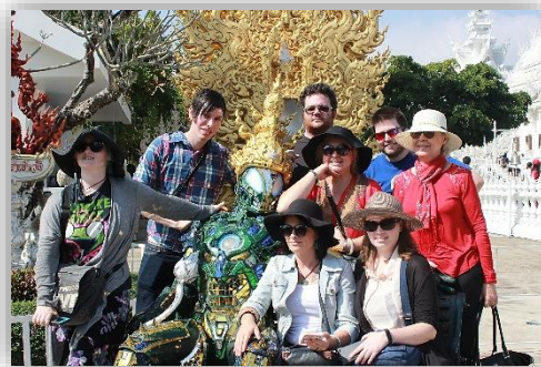
Photo Caption: Wat Rong Khun, also known as “The White Temple” is one of the most recognizable temples in Chiang Rai. The temple outside the town of Chiang Rai attracts a large number of visitors, both Thai people and foreigners, making it one of Chiang Rai’s biggest tourist attractions. Students have a chance to visit a unique temple that stands out through the white colour and the use of pieces of glass in the plaster, sparkling in the sun where was designed by Chalermchai Kositpipat, a famous visual artist in Thailand.