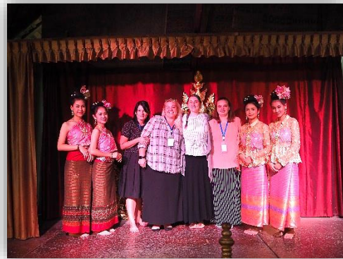
Photo Caption: At the end of day 1, students were treated to a northern Thai dinner and traditional dance performance. Set in an old traditional wooden house, students were treated to 8 different dance performances. The dinner itself consisted of various traditional northern Thai cuisines including fried chicken, tomato with pork, green chili paste with vegetables, sweet noodles, pork rinds, northern Thai curry with pork, and sticky rice.