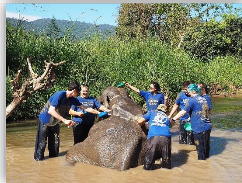
Photo Caption: Always a popular activity amongst international students is the chance to visit an elephant nature park. During this visit, students took care of their very own elephant for the day which includes feeding and bathing the elephant before taking a short jungle ride. The elephant camp is located 60 minutes from Chiang Mai University.