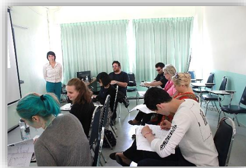
Photo Caption: This course aims to provide a short introduction language course to students. The students learnt about tone marks, greetings, places of interest, talking about daily life activities, numbers, food and drinks. The teacher also provided them some basic foundation and knowledge about the Wai, social etiquette and other important aspects regarding Thai culture.