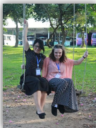
Photo Caption: Day 1 at Chiang Mai University saw the students take a campus tour with the Chiang Mai University buddies. During the tour, students had the chance to stop at the famous Ang Kaew Reservoir, which is a popular destination for CMU students to relax during the evening. Afterwards, students visited the religious pavilion of Sala Tam which is used for functions and various important ceremonies at CMU.