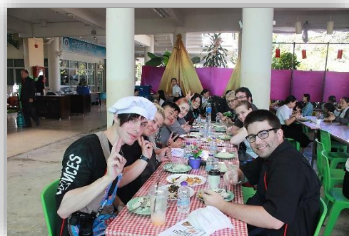
Photo Caption: Thai cooking is a great activity for students to learn how to create their very own meals which can be useful for the future when the students return back home. During this session, students cooked 3 unique dishes including: stir-fried pork with basil leaves, sweet and sour egg with tamarind and black jelly in milk.