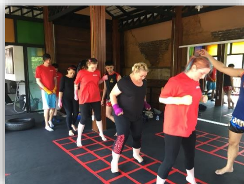
Photo Caption: Muay Thai is Thailand's national sport, which is a combat sport that uses stand-up striking along with various clinching techniques. Students had an opportunity to learn the ancient art of Muay Thai with some basic hand and foot movements.