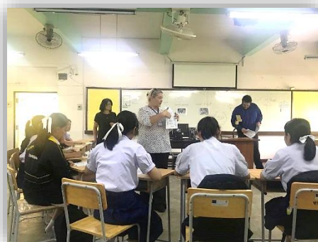
Photo Caption: GU Students became trainee teachers assigned to teach high school students at Hopra School and Wichai Wittaya International School. Following a pre-designed lesson plan were required to teach communicative English. Language Institute Chiang Mai University provided the experienced instructors to observe the trainee teachers in class and provided detailed feedback to assist them in order to develop their teaching skills.