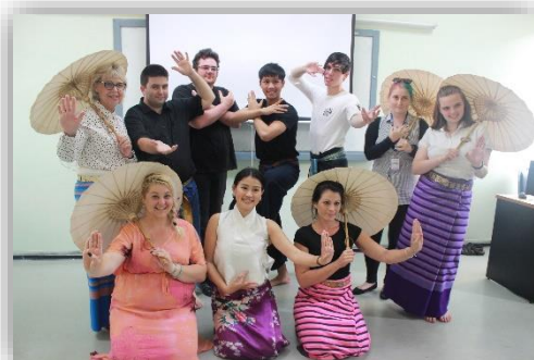
Photo Caption: The Thai Lanna Dancing activity introduces the students to the traditional art of dancing in Thailand. Thai Lanna Dancing is a northern style dance which gives an opportunity to both female and male students to participate in this traditional dance. The students learnt basic hand movements and footsteps as well as trying authentic costumes for this dance.