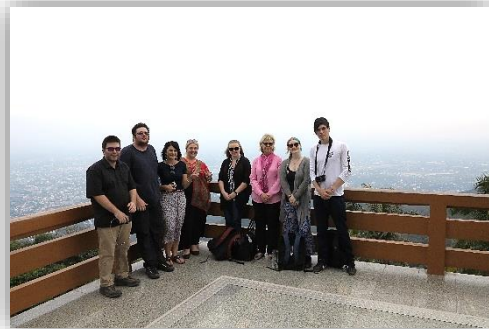
Photo Caption: Doi Suthep temple is the highest temple located in Chiang Mai city. It is the most revered temple. During this visit, students will navigate the 300 steps to reach the summit of the golden pagoda and learn about traditional Buddhist merit making activities, which involves walking in a clockwise direction around the golden pagoda 3 times whilst repeating a phrase. At the top of Doi Suthep temple, students are treated to specular views of Chiang Mai.