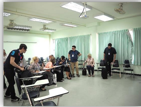
Photo Caption: The ice-breaking activity is an important part of program as it introduces the students to the CMU buddies for the first time. Ice-breaking is the process of breaking down the barriers which exist to make communication easier for people meeting for the first time, to engage one another with small talk and to find areas and topics of interest to talk about. After this session, students will feel more comfortable to contact one another and meet on a regular basis thereafter.