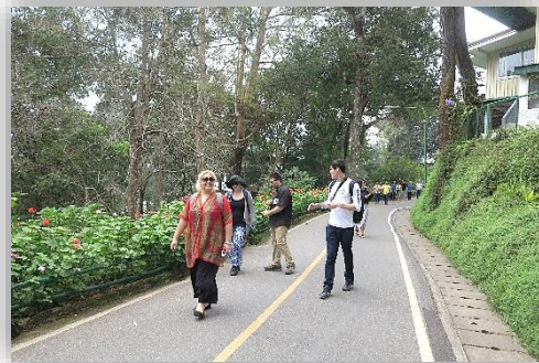
Photo Caption: Bhubing Palace is the royal winter residence in Chiang Mai where the royal family stays during seasonal visits to the people in the northern part of Thailand. It's also the royal guesthouse for prominent state visitors from abroad. During the visit, students enjoyed a wide variety of flowers—not only the famous Thai orchids, but also roses grown here that are not commonly found in Thailand.