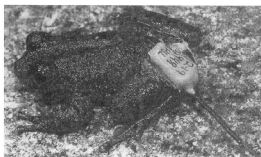
FIG. 2. Waterfall frog, Litoria nannotis , with transmitter attached.