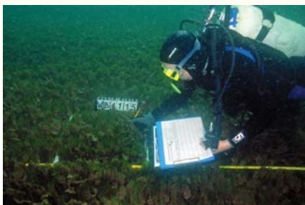
Monitoring the seagrass beds at Wave Break Island

The Broadwater is home to several seagrass communities, found in shallow areas that are sheltered from high-energy waves. In fact, seagrass currently covers 22 per cent of this estuary. Other areas that provide optimum conditions for seagrass growth on the Gold Coast include Currumbin and Tallebudgera Creeks.