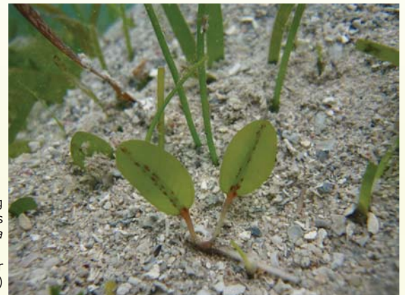
Dugong grass Halophila ovalis

Seagrass has been described as an ecological engineer, because of its ability to rapidly colonise areas of the seafloor. Once it has moved into an area, seagrass can stabilise the seabed and effectively alter the environment, making it possible for other flora and fauna to establish. Seagrass varieties also share valuable associations with mangrove and reef environments.