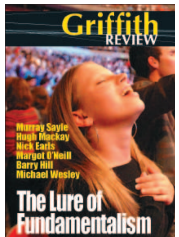
COVER: The latest edition of Griffith REVIEW.