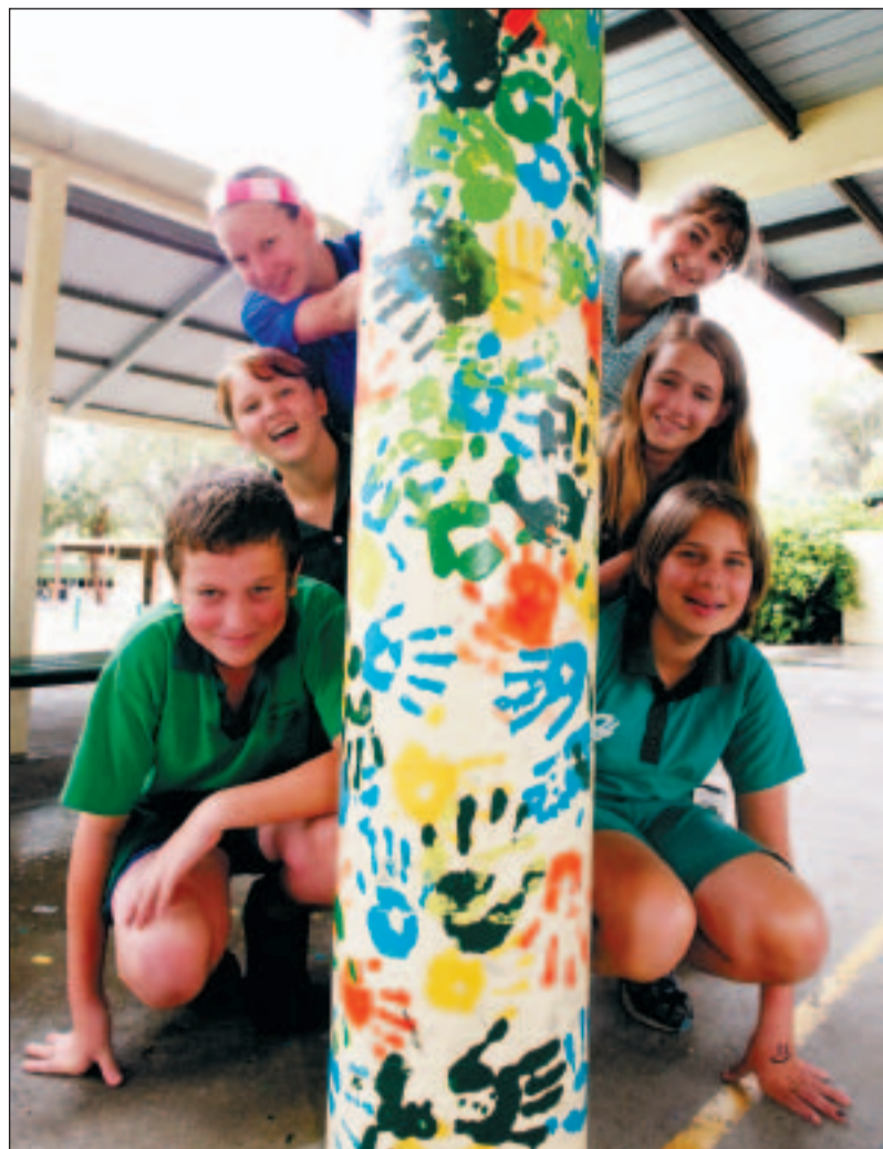
PEACEFUL CLASSROOMS: Helensvale primary school students with the colourful peace mural they painted.

For more details visit the website at www.griffith.edu.au/centre/asiainstitute/