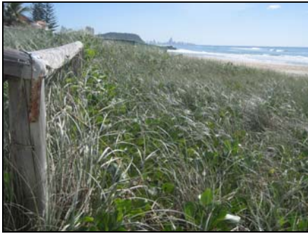
Photo: Spinifex grass on the foredunes at Palm Beach

These plants are generally formed of long runners that spread out across the dunes covering a large area thus reducing wind blown sand. Each node (point where set of leaves attach) usually has a root system attached that firmly holds the plant in place. These plants can generally handle being smothered by sand (particularly spinifex) by growing upright and quickly through the sand. Primary plant species can tolerate low nutrients, limited fresh water and high temperatures. They are however, relatively fragile to trampling.