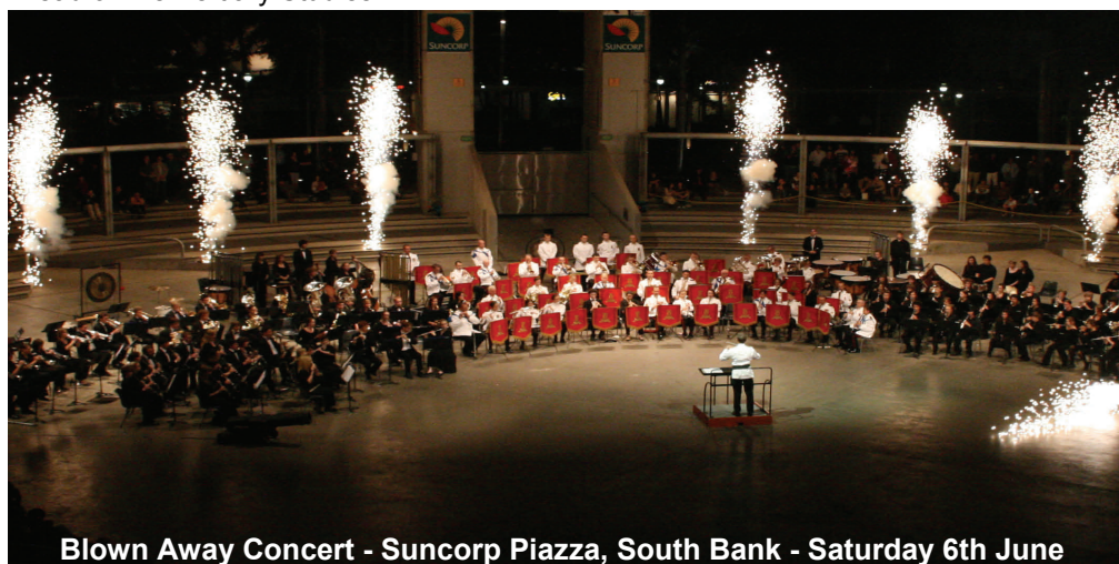
Blown Away Concert - Suncorp Piazza, South Bank - Saturday 6th June