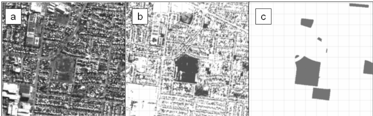
Figure 2: (a) QuickBird 2.5 m imagery, unclassified, clearly shows urban infrastructure with brighter tones associated with high levels of reflectance in the visible spectrum (such as roofs) and darker areas of vegetation and asphalt surfaces. (b) QuickBird 2.5 m imagery, classified using Normalized Difference Vegetation Index (NDVI). Greyscale is indicative of vegetation cover with white areas non-vegetated and dark areas densely vegetated. (c) Designated Public Open Space as compiled by ARCUE in 1999 (Leary and McDonnell, 2001).

The next step was to compare our greenspace layer with the Public Open Space Database that was compiled by ARCUE in 1999 from (Leary and McDonnell, 2001). The database utilised multiple datasets in its construction including information from local park authorities, field surveys, local council records and street directories. The aim was to compare total greenspace (as measured through remote sensing) with that in public ownership (as mapped by ARCUE). Figure 2 shows the datasets, for a demonstration area, that were used to undertake this greenspace comparison. Importantly, the QuickBird imagery is of sufficient detail to allow detection of individual trees.