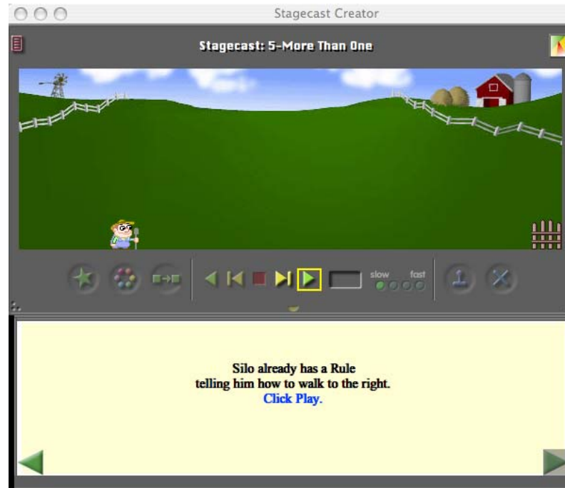
Figure 1: Stage Cast Creator 2 ™ tutorial screen shot

I argue, however, that in order to be fully literate in this mode, users must be able to create their own games. We used a simple game engine called StageCast Creator2 ™ (SCC) (www.stagecast.com). Originally created as a tool to teach programming, SCC uses a simple graphical programming scheme where learners can manipulate objects and create simulations without using a programming language. Students are able to ‘look behind the curtain’ at how games are made. SCC has drawing and graphics tools to create objects and characters, and tools to establish rules for their behaviour and relationships. SCC is also a tool for constructing interactive presentations called sims that can be quite sophisticated (see Figure 1).